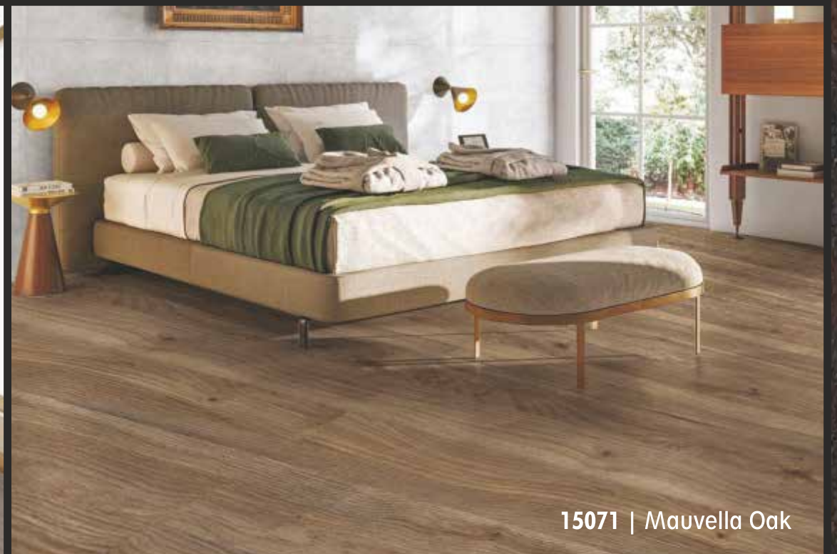
15071 | Mauvella Oak