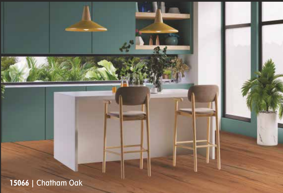
15066 | Chatham Oak