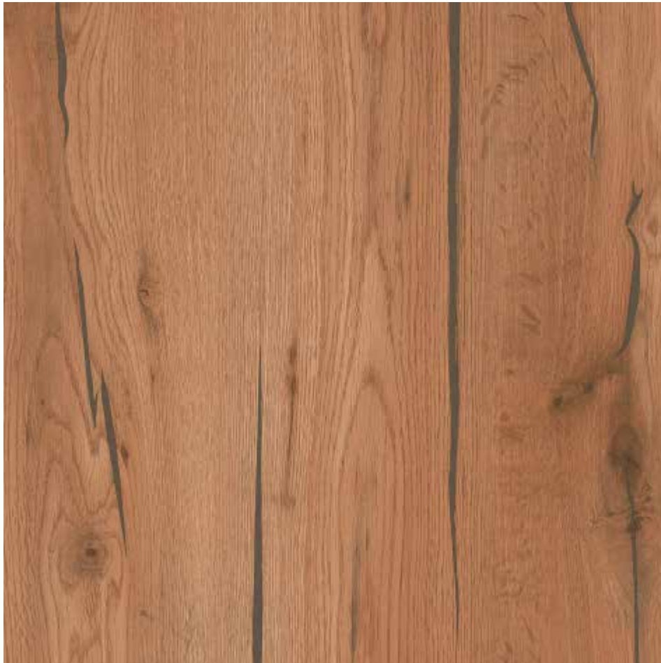
15066 | Chatham Oak