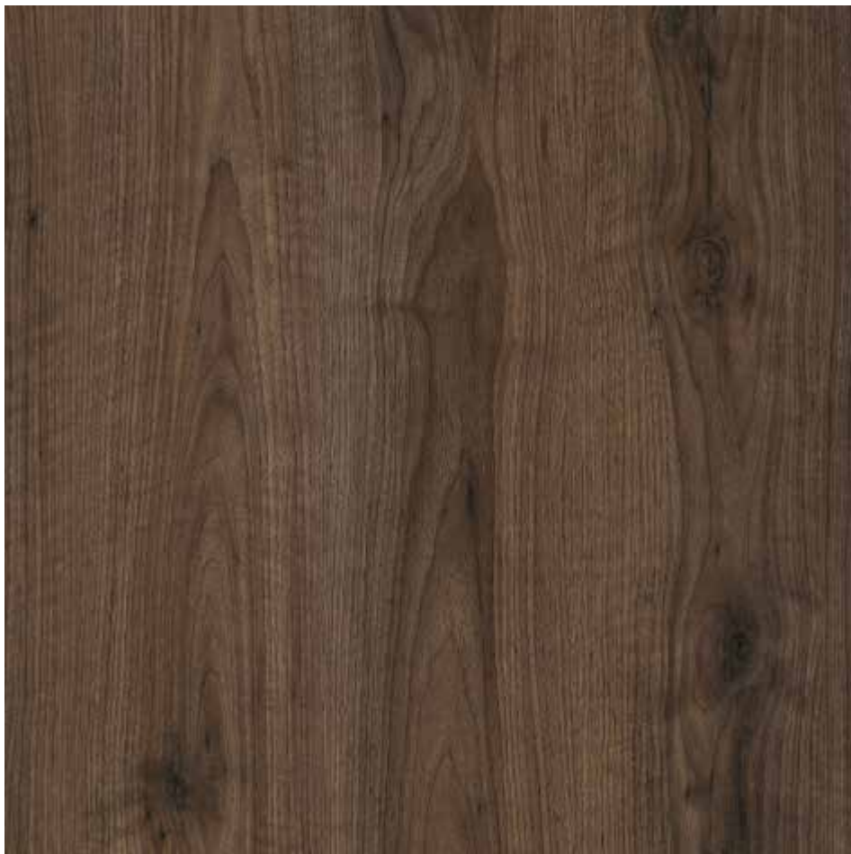
15068 | Girona Walnut Brown