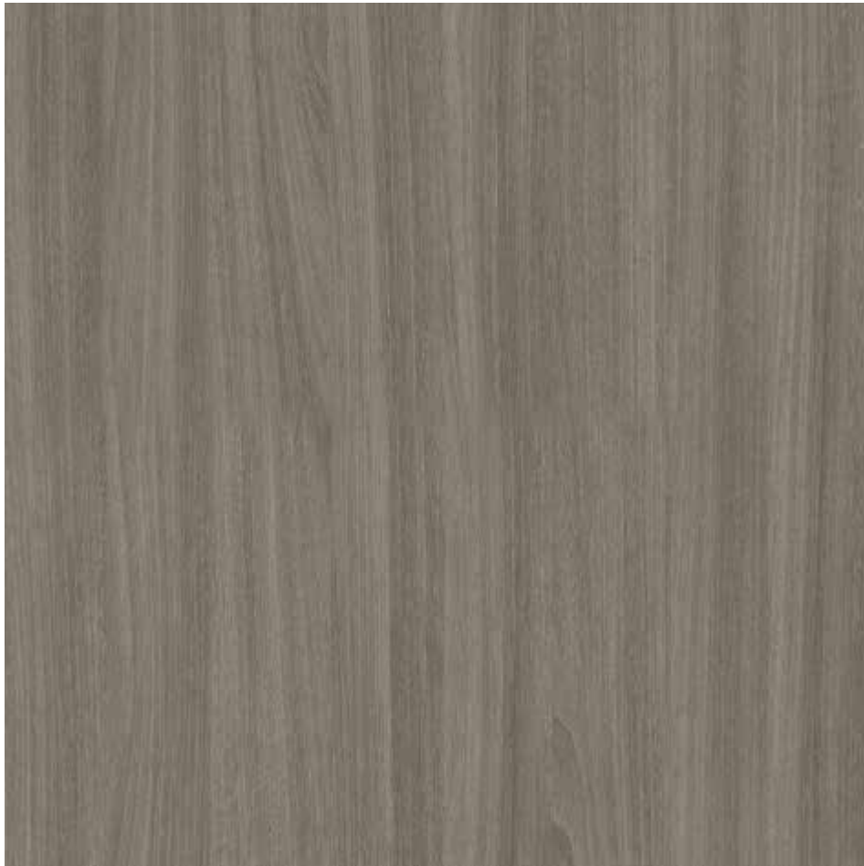
15070 | Jarrah