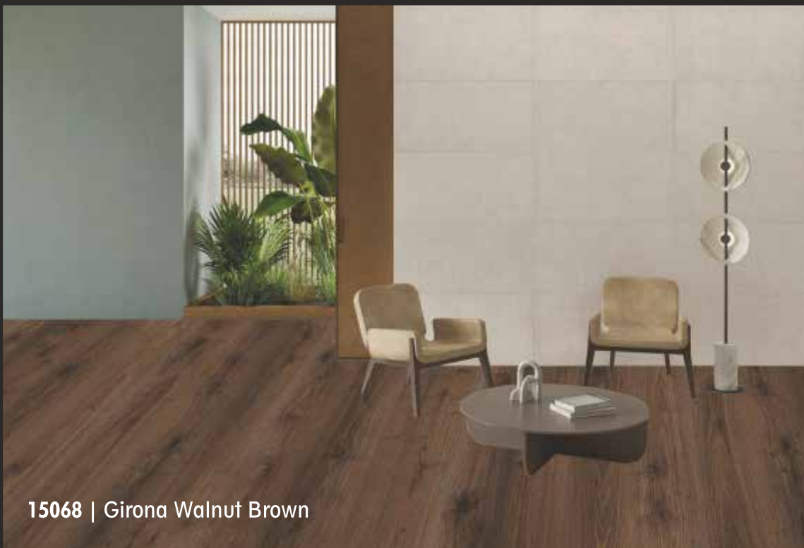
15068 | Girona Walnut Brown