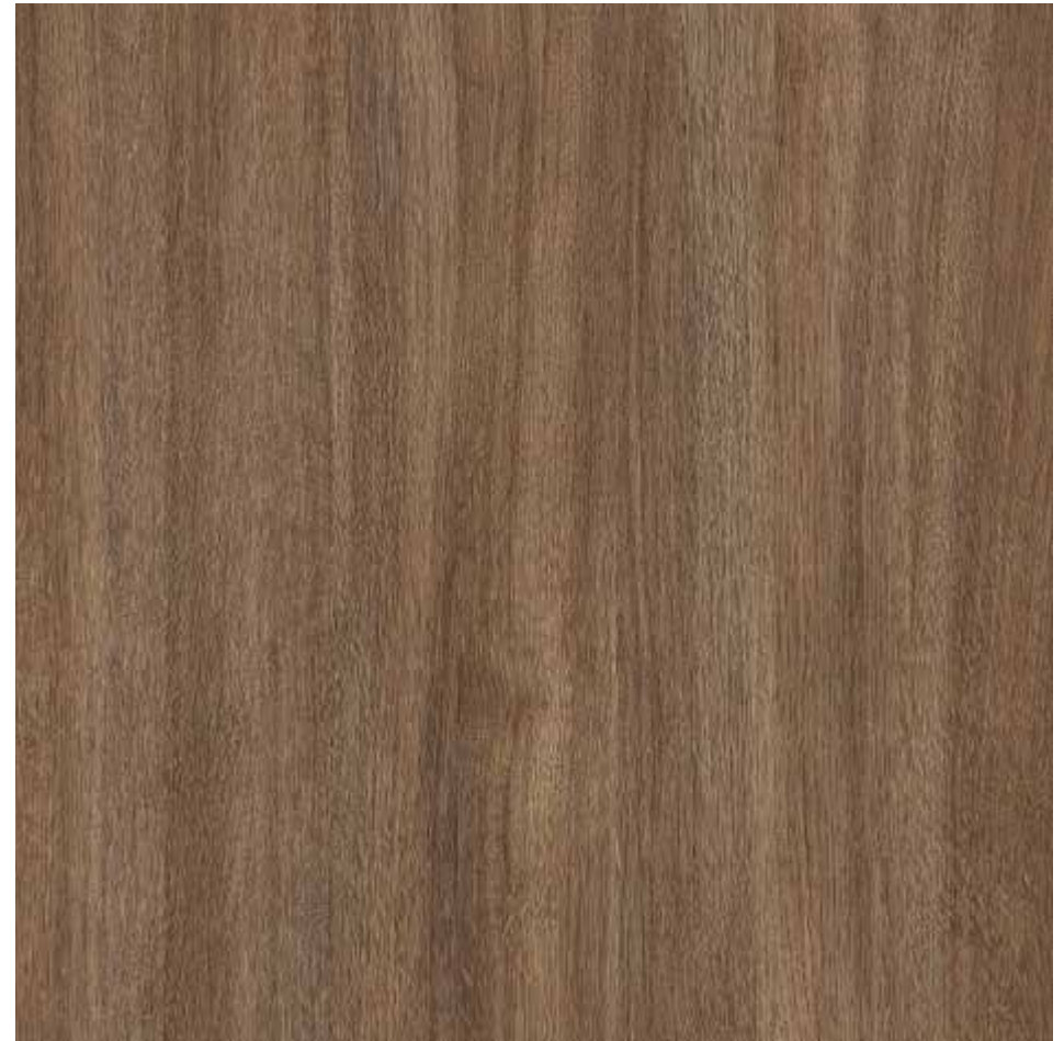
15067 | Clashmore Oak