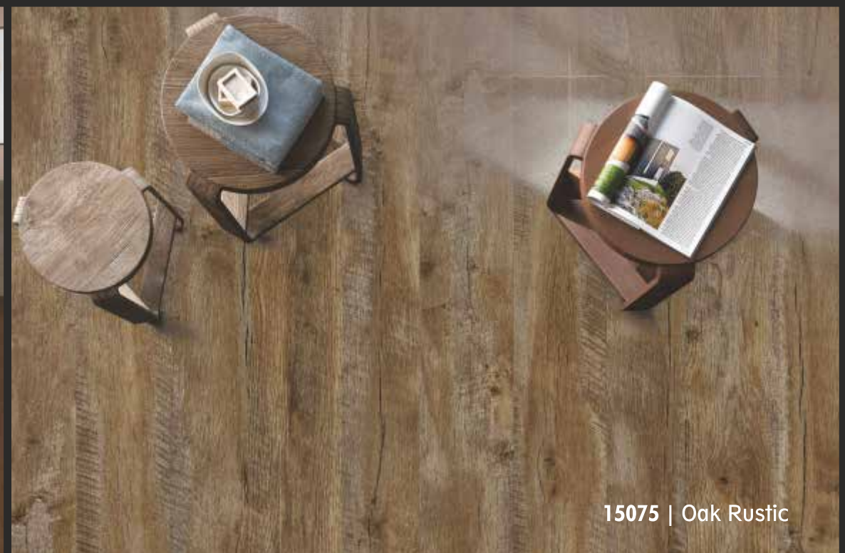
15075 | Oak Rustic