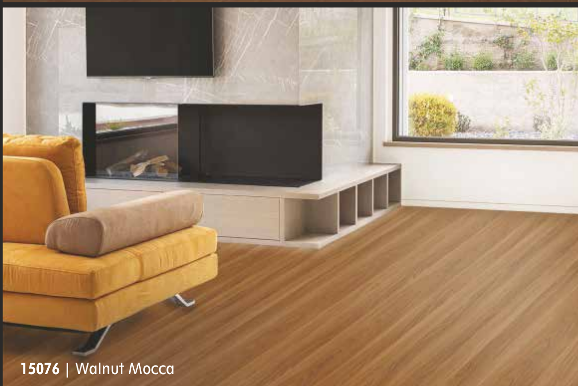
15076 | Walnut Mocca