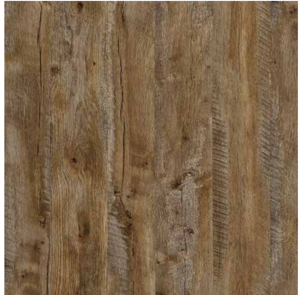
15075 | Oak Rustic