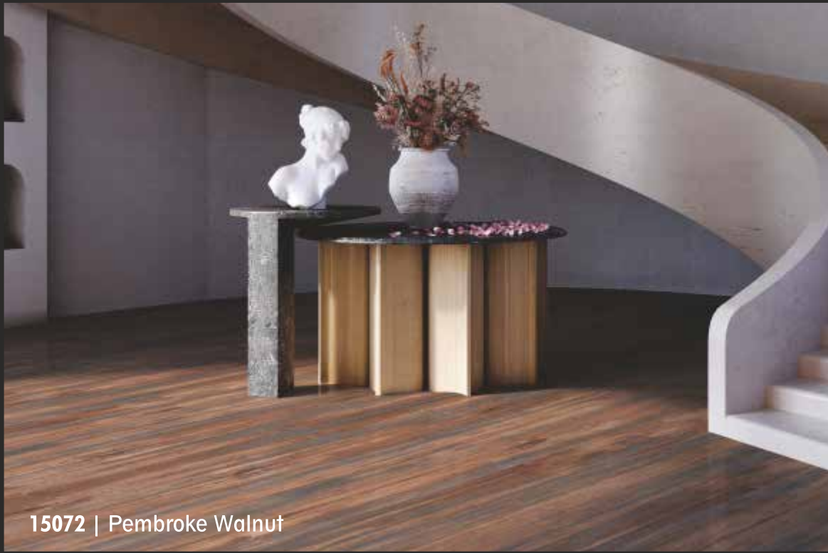
15072 | Pembroke Walnut