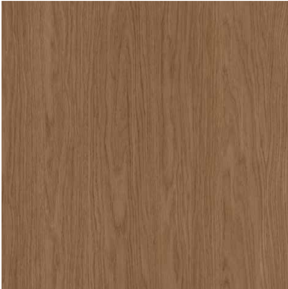
15074 | White Oiled Oak Natural Brown