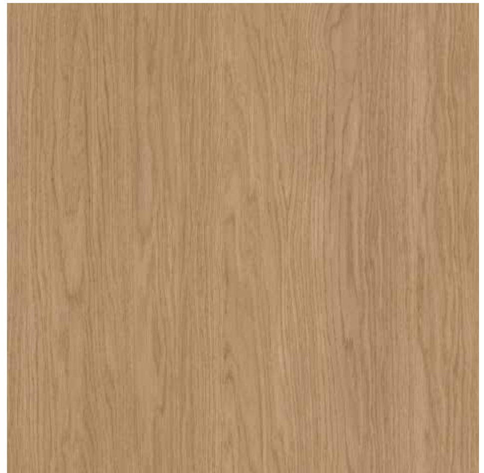
15073 | White Oiled Oak Natural Light