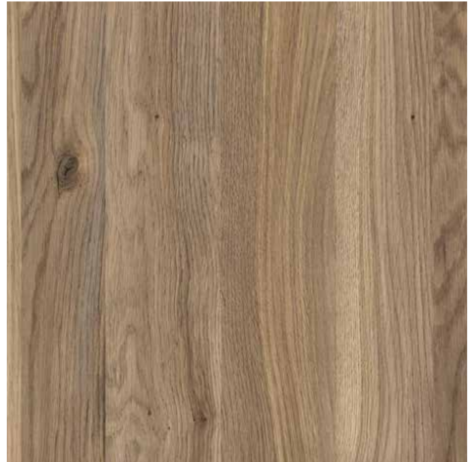
15071 | Mauvella Oak