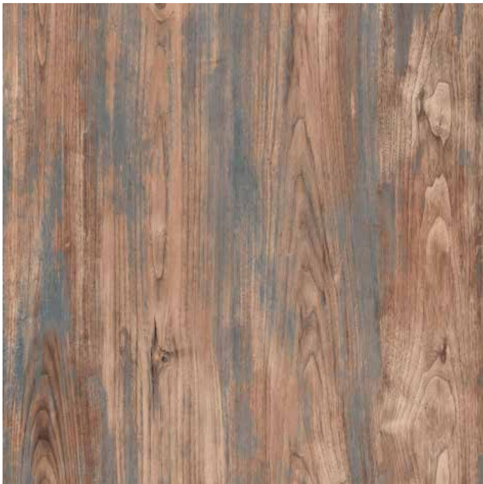
15072 | Pembroke Walnut