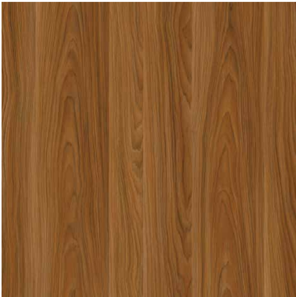
15076 | Walnut Mocca