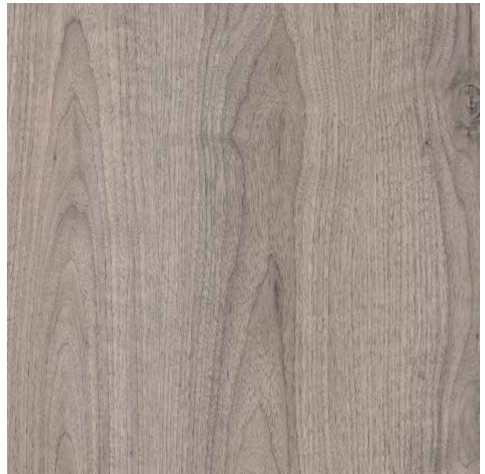
15069 | Girona Walnut Grey