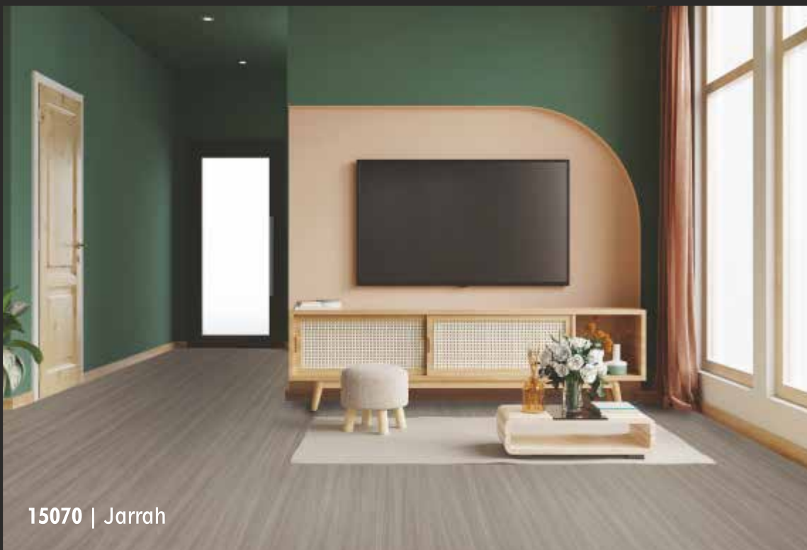
15070 | Jarrah