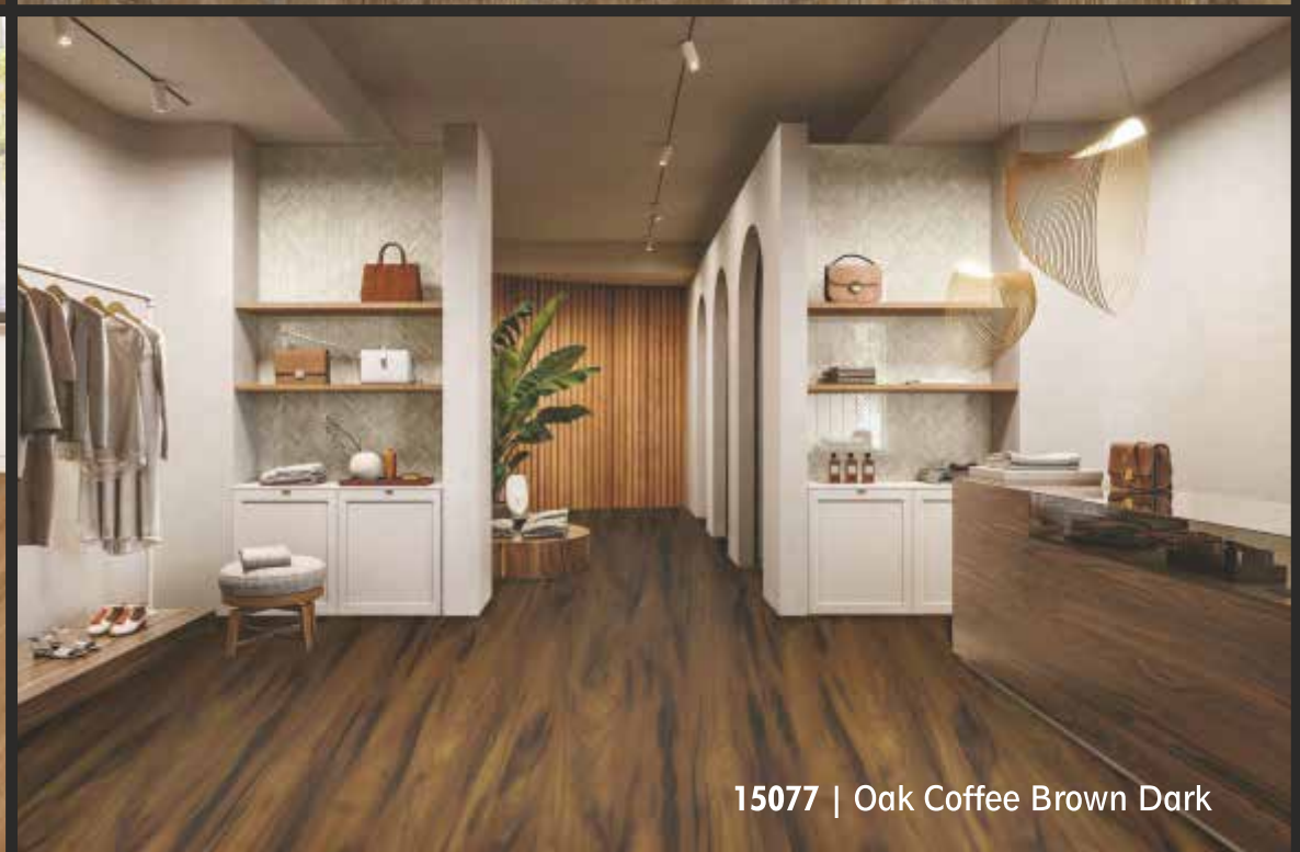
15077 | Oak Coffee Brown Dark