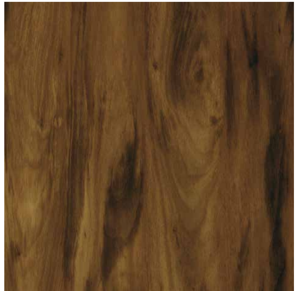
15077 | Oak Coffee Brown Dark