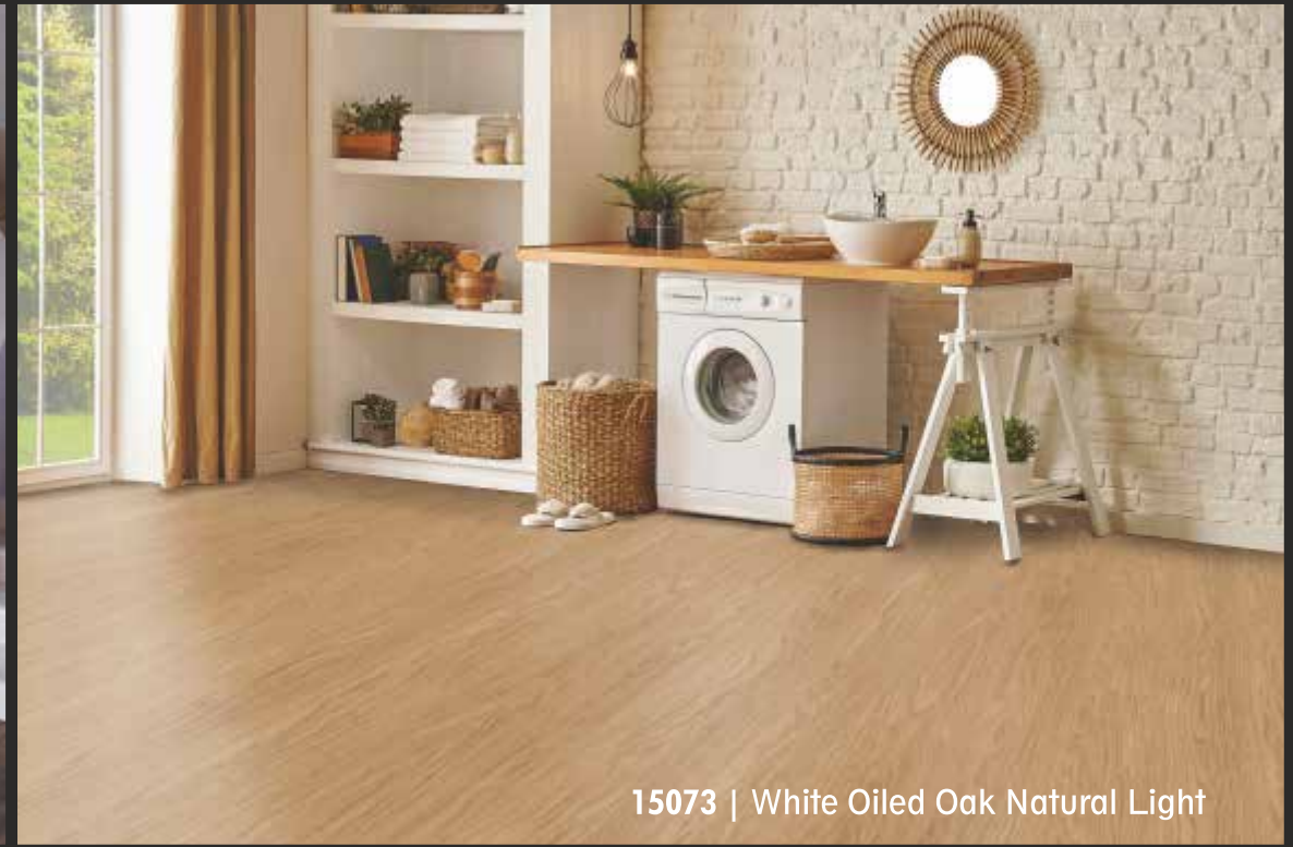
15073 | White Oiled Oak Natural Light