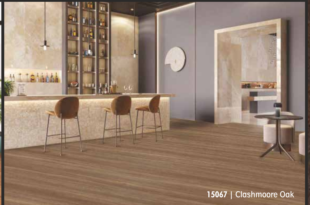
15067 | Clashmore Oak