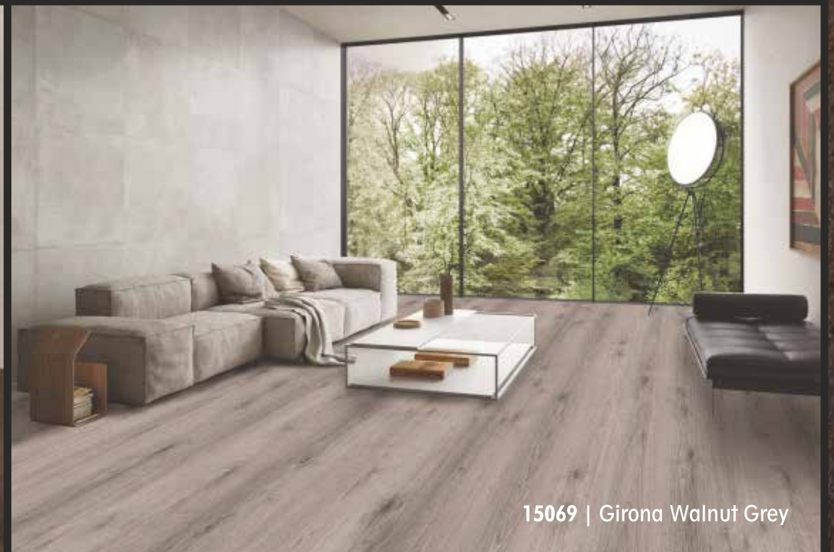
15069 | Girona Walnut Grey